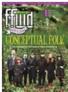
Volume 14 No. 33 July 23, 2009

Smile! The Calgary Farmers' Market board is watching 8